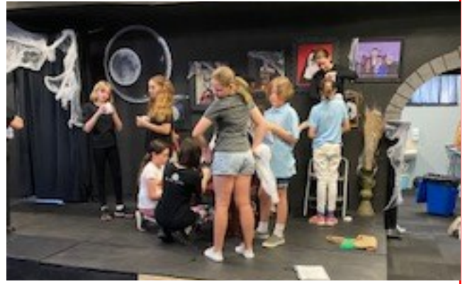
The Juniors having a lesson and fun set dressing.

The Little Players are also in rehearsal.