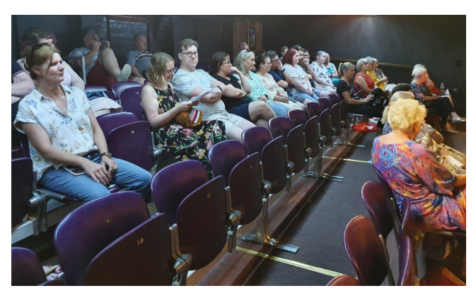
Some of the 40 attendees taking rapt interest in proceedings. What was wrong with Row B?