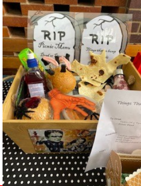
The photos are of some of the breakfast baskets at the breakup of the Juniors.