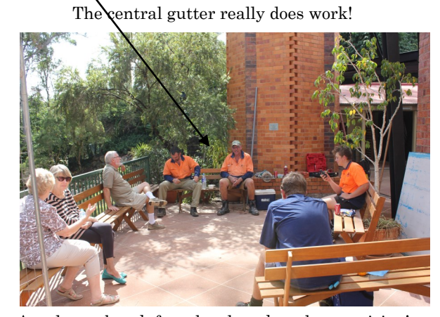
A welcome break from hard work and supervision!