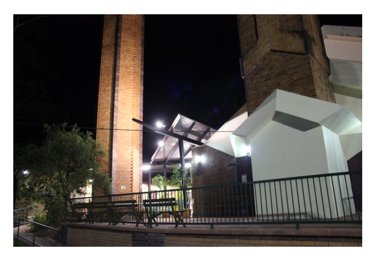
Lovely at night