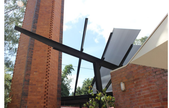
The roofing is going on. The last sheet was wrongly supplied and the replacement took another week to arrive.