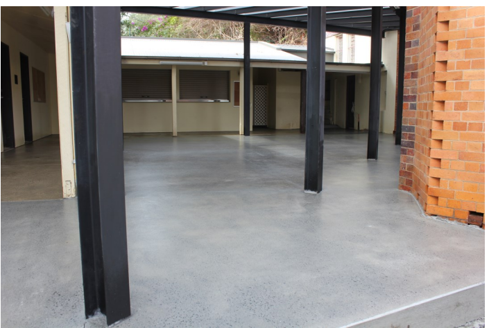
The new polished floor (and grey roof)