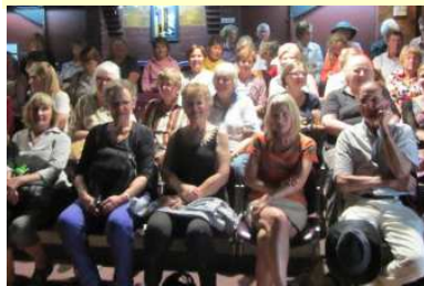
Part of the audience rapt in the play at the last tour of 2012