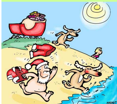
The Aussie spirit of Christmas.

Also, if you have any ideas for other social gatherings, do let us know.