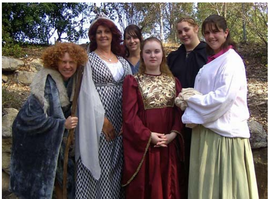
Above – the good ladies of Lady Macbeth

Editor's note: please do not hesitate to contact The Advertiser if you agree that this is a backward step for arts reporting in our region. Can you imagine having a 'sports' section in the paper only once a month!!