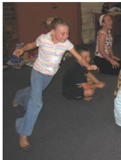
Past and present participants in the SmartArts group enjoying themselves while they learn through play.