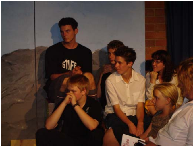
Audience members at the 1 st Speed Poets performance at ILT

All Theatre Activity Nights have now been completed for 2005 - watch for news of the 2006 program early next year.