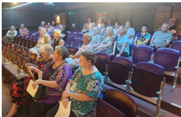
The members rapt in the proceedings