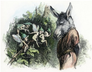
Watch your bottom!

The current plan is for the play to be presented in the Incinerator on 21 June with two performances: 8:30 am and 10:30 am. This times have yet to be confirmed in consultation with parents once classes resume after the school holiday break.