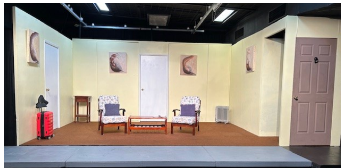
The set for Heading for Home