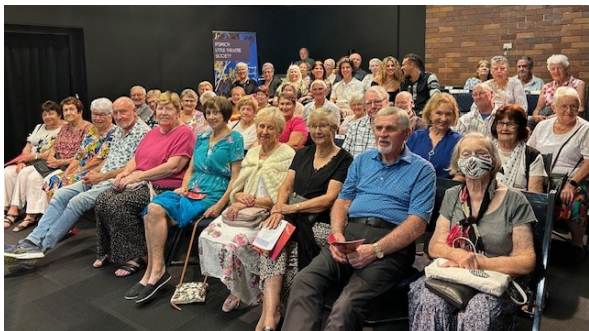
The audience in the Jean Pratt Building on 13 March

We continue to be amazed by the fact that patrons, even regular ones, do not know of the existence of the Jean Pratt Building, let alone the fact that it is a performance venue with, for this season, tiered seating (see photograph) and a removable stage, even smaller than the Incinerator one.