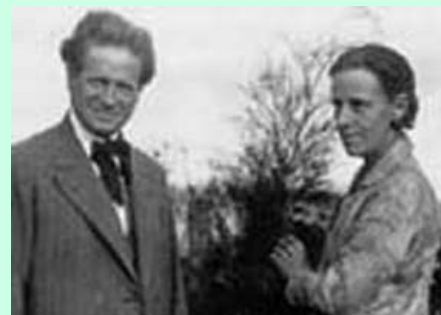
Walter Burley & Marion Mahoney Griffin