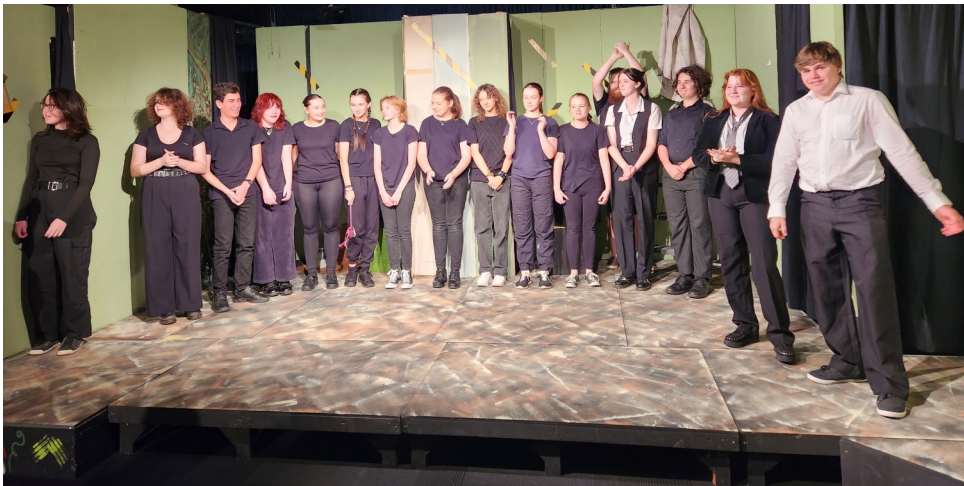
The YTs take a bow.