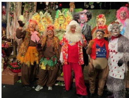
Above: the entire cast