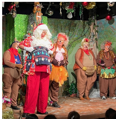
Santa and the Woop Woop creatures