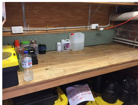
Above: The immaculate Wendy House