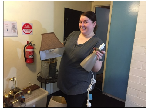
R: Kate, the Lady with The Lamp