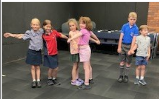
Little Players bonding at their first lesson of the year.