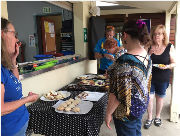
Above, R & Below: Morning tea was very welcome!