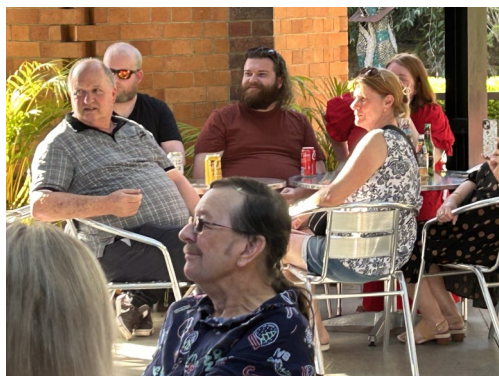
Members enjoying each other's company and good food.