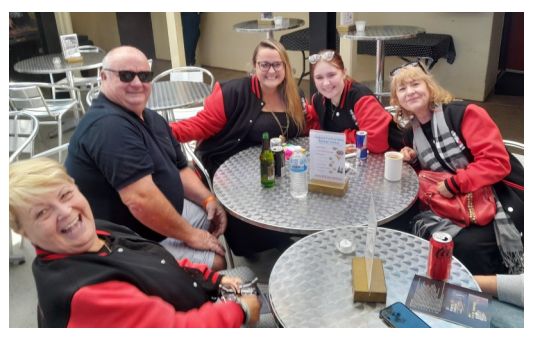
A collection of Blackout Collectives enjoying a break in the courtyard.