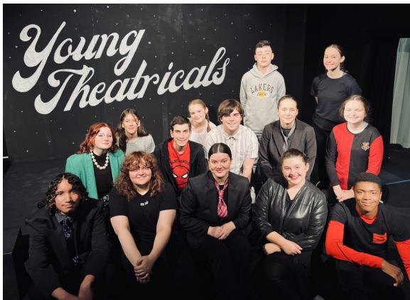
The YTs at the end of their marathon presentation

The Young Theatricals Showcase Production was presented in the Jean Pratt Building on 9, 10 and 11 September. After a few hiccups in the lead up to the weekend, the group enjoyed an incredibly successful three days. With a couple of last minute cut pieces, they still managed to pull off a pretty great show! They sold exactly 100 tickets over the weekend to audiences that were very supportive. It was great to see the students' family, friends and even their school teachers coming to watch