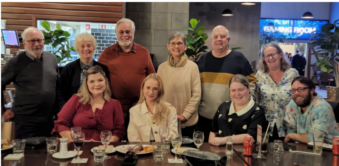
Dinner at Char'd the night before ..