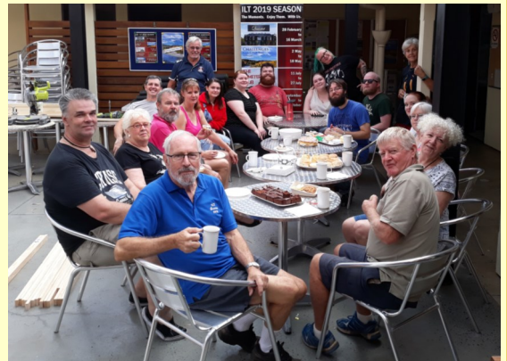
Casts and workers taking a tea break from bump-out/bump-in for "Quartet" and "Challenges"

Cyril Evans, a 59 year old bachelor, is desperate to honour his promise to his father never to sell the family property. When he runs a personal ad in Queensland Country Life offering to swap his reconditioned John Deere 9750 STS combine harvester in return for a wife of 'breeding age' – all hell breaks loose!