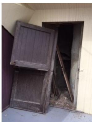
The old door

The door was originally installed by us as a stable door when it was hoped to use the chimney as a ticket box. This never happened.