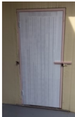
The new – to be painted