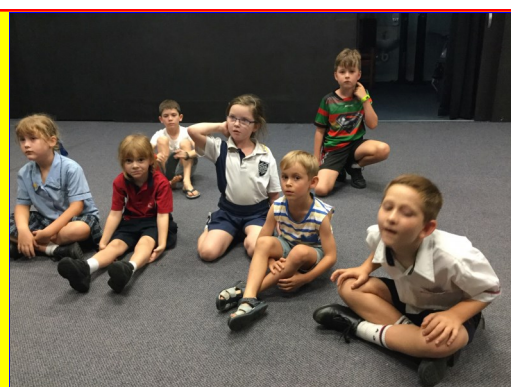
The Little Players taking it all in

Little Players reconvened on Thursday 7 February with four students returning from last year, and four new students. There are a couple of places available in this group.