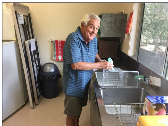
We tackled the kitchen in the Jean Pratt Building ....