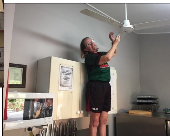
... the kitchen got a thorough make-over ...