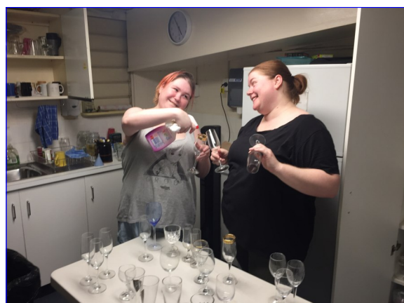
... backstage was attacked with an assault on the cupboards, reducing the multiplicity of glassware and crockery (who would have believed we could have accumulated so many unmatched articles) ....