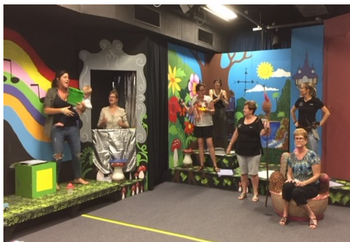
Above: The ladies rehearsing in their very colourful set ...

Our little folk who join us weekly know many of the lines and songs and are very well behaved.