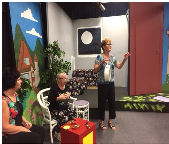
Right: ... with an optional extra