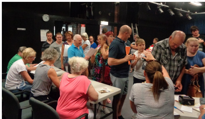
S-Troupers signing on