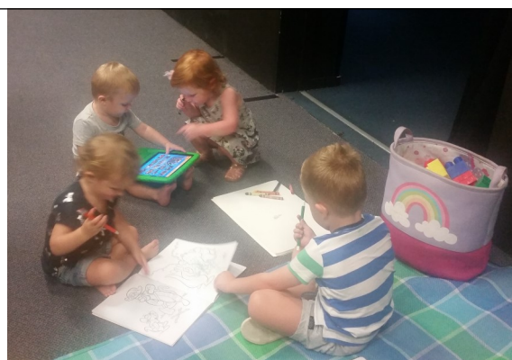
Some of today's bubs at DTT rehearsal

All the ladies are hard at work preparing the presentation of Trouble in Storybook Land in June. More information on the cast and progress in future newsletters.