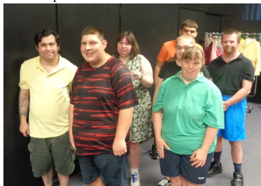
Left: The seven new students