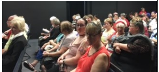
The audience with bated breath.