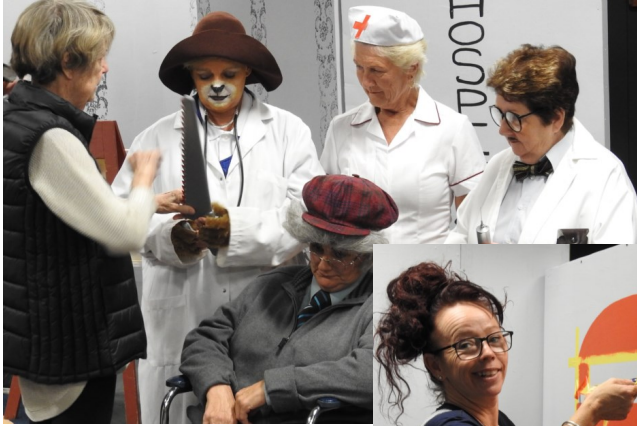
Above: Director and Cast in rehearsal