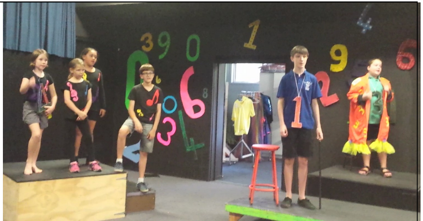
The Juniors rehearsing in front of the numbers they created.