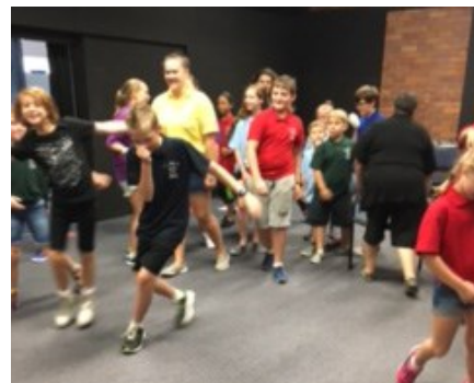
Juniors in their rainbow shirts

Coloured polo shirts have been purchased for the students and embroidered with the Theatre Logo and the name 'Juniors' added. The students are thrilled