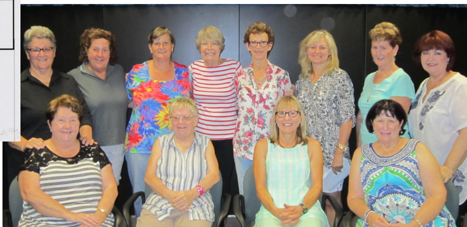
(Some of) the Cast of "The Cute Little Bear from Peru"

As an extra activity, Lighting Director Rob Bendell has been running workshops on stage lighting for the group which the ladies have thoroughly enjoyed.