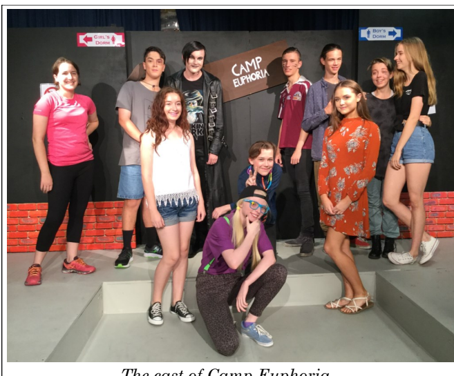
The cast of Camp Euphoria

The Junior celebrations in the courtyard