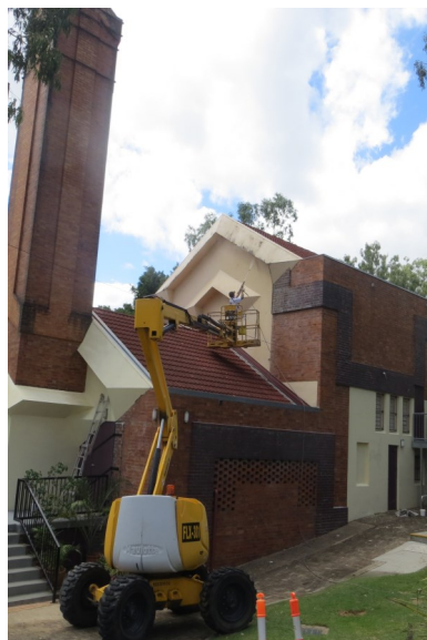
Cleaning the gable end from a cherry picker

Footnote: the foreman painter admitted that he had lived in Ipswich for all the 60 years or so of his life and never knew the building existed.