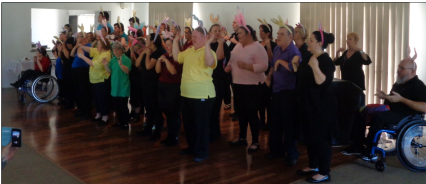
S-Troupers performing at "The Springs"

Students and helpers all received an Easter egg reward for their hard work before packing up and heading back to theatre.