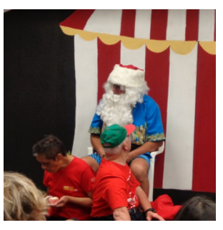
No guesses for his true identity!

They are now in recess until the end of January.