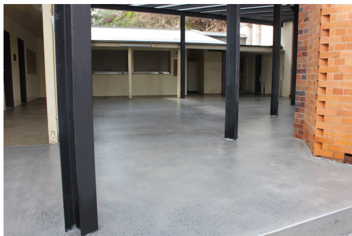
The new polished floor (and grey roof)