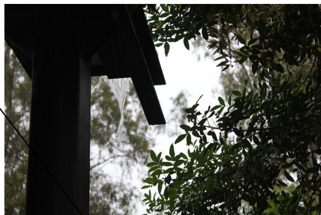
The central gutter really does work!

The roofing is going on. The last sheet was wrongly sup- plied and the replacement took another week to arrive.