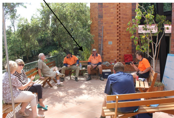
A welcome break from hard work and supervision!