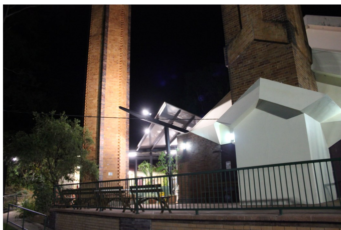
Lovely at night