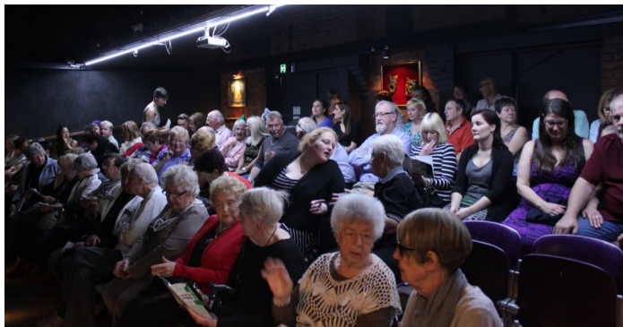
The expectant audience