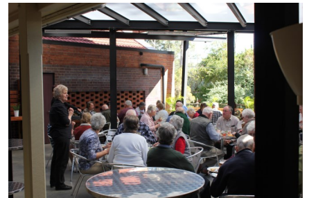
Members of a visiting Probus group enjoying lunch in the courtyard