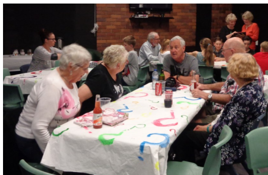
Left: Participants seeking answers!