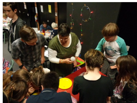
Right: Additional challenges for our younger participants

The Juniors have now commenced preparations for their next show, again written by Deirdre. More details to come.