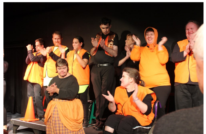
Right: S-Troupe Command Performance