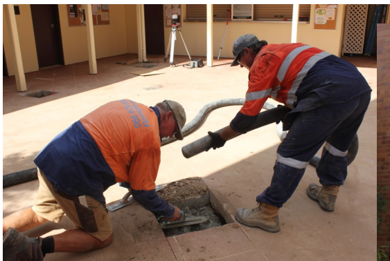
Above: Concrete progress