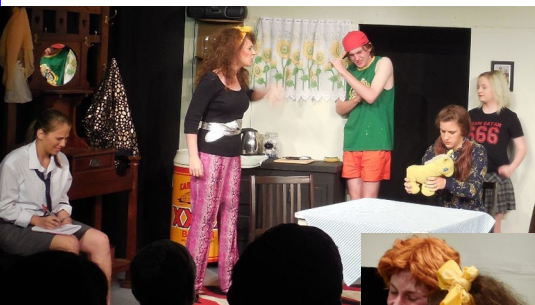
Scenes from the show – the result of a lot of hard work.