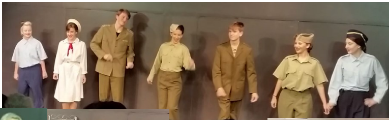
The dance ensemble