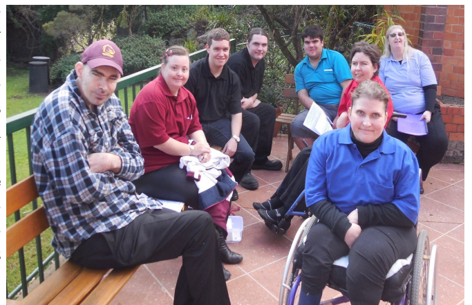
The poetry group getting ready for their performance at the Festival

As well, the S-Troupe poetry group filled in during the adjudicator's deliberations about the Youth Section of the festival – an enjoyable performance in advance of their regular appearance at the Silkstone Eisteddfod.