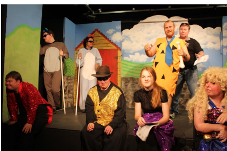
Some of the S-Troupers entertaining the audience with a segment from "The Two of Us"