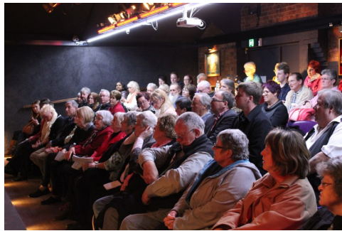
The audience hanging on the adjudicator's every word