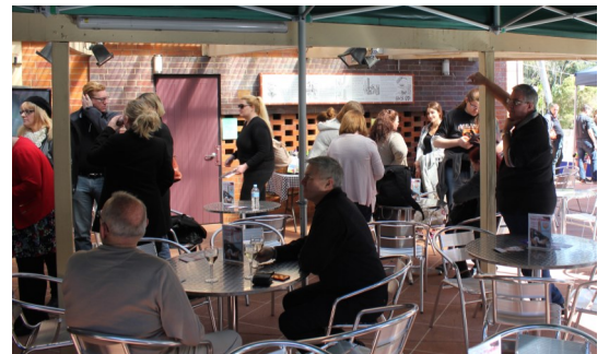
The famous barbecue luncheon