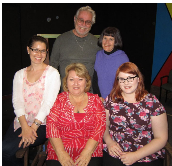
The cast of “Entertaining Angels”