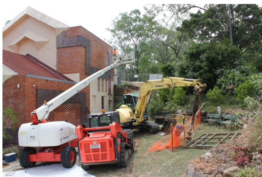
Equipment on site at the commencement of the job

Below: Repointing of the brickwork in progress.