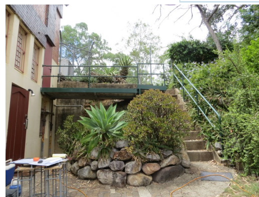
The doomed fire escape and the old concrete stairs