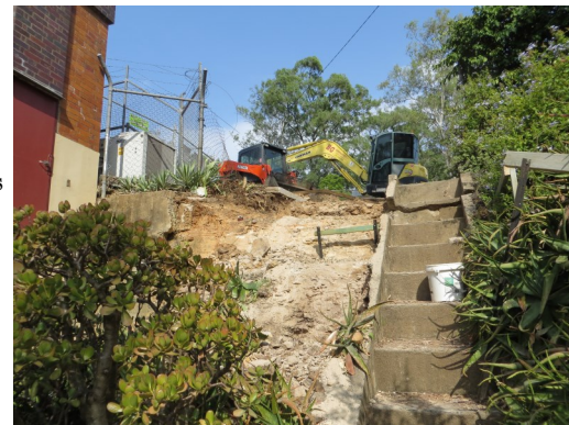
Above: The old fire escape removed with foundation preparation under way.