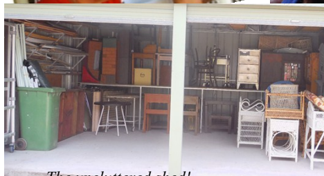
The uncluttered shed!