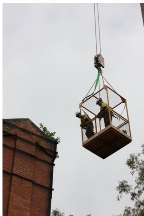
ICC officers using a crane-supported cage to deal with the trees in the chimney

Helen Pullar Convener of Building Committee