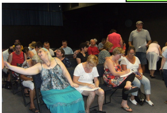
S-Troupers signing on for another year

Classes will commence on 4 March, but prior to that, the Troupers enjoyed their eagerly awaited trip to see Mary Poppins at QPAC, Brisbane. There will be a full report on the trip in next month's Newsletter.