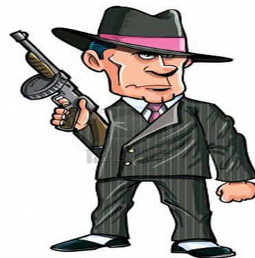
'BIG LOUIS AND THE CANTOUCHEMS'