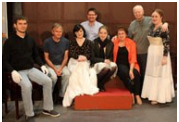
Cast and crew of Duet for Two Hands

It is interesting to note that around half our bookings are now done through the website and the other half through the VIC.