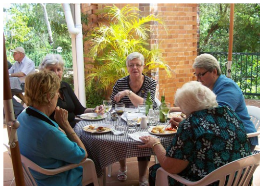
Tourific visitors enjoying lunch at the Incinerator on 17 April

This year, it has also been decided to limit the number of tours to reduce the workload on the volunteers. Thirteen tours have been booked (two of which have already been held). But this does not satisfy the demand and it has already been necessary to knock back a number of applications. Obviously our reputation is spread far and wide with so many groups telling us it is the best outing their club has ever been on. Just how many Probus groups are there in the world?