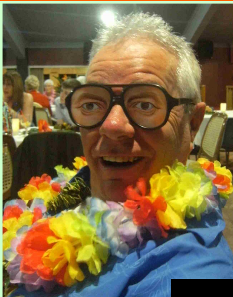
Our esteemed President enjoying himself at the Theatre Festival Awards Dinner, Norfolk Island.

NOTE: this phone is not staffed at other times.