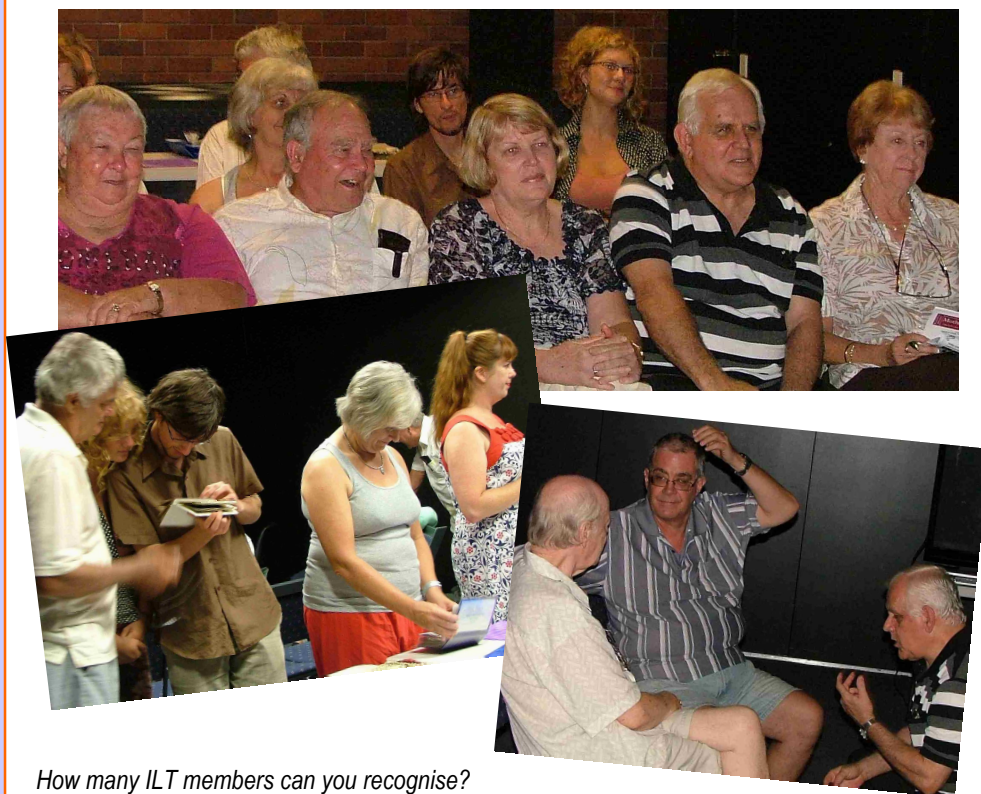
How many ILT members can you recognise?