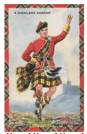
Hurry! Hurry! Hurry! Only 87 seats left at the last count up to 3 October contact Helen Pullar for tickets and then it is Robyn as the contact person again.

Bookings available by phoning: Robyn Flashman: 3812 3450