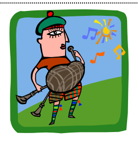
Ipswich Little Theatre Presents