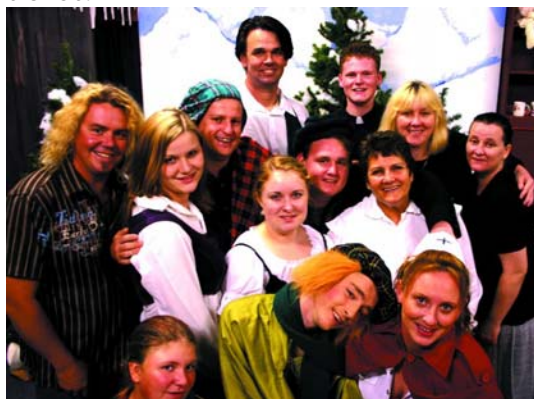
The whole clan of Highland Fling looking forward to entertaining you at this year's Theatre Restaurant