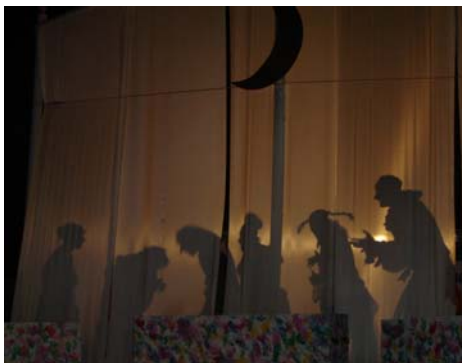
Image from Clown Verona Queens Park, Toowoomba Saturday 5 March 2005