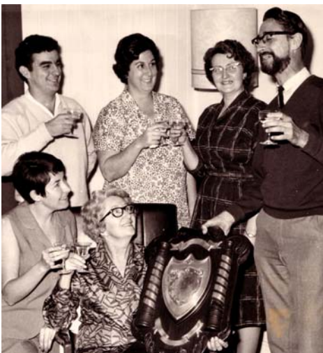
A lovely image of past ILT Festival winners. Do you recognise any of the actors?